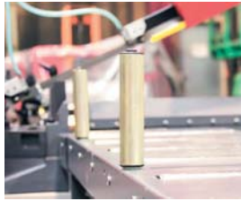
Vertical side rollers

With the bearing capacity up to 150 kg/m, a wide range of optional accessories, and connection pieces to BOMAR bandsaws, the "M" System is ideal for handling material in your workshop. Thanks to their default length of 2 and 3 m, roller tracks may be flexibly adjusted to any environment.