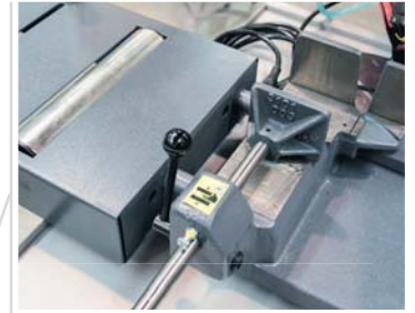
Connection of the inlet roller conveyor - detail